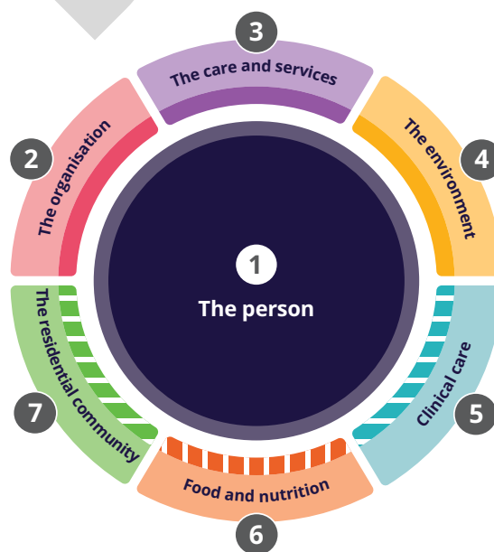
Figure 1: The strengthened Quality Standards

Providers are responsible for establishing and maintaining systems to ensure they meet the strengthened Quality Standards at all times. This includes developing and implementing policies and procedures, training, educating and supporting workers to deliver care in line with the strengthened Quality Standards and monitoring outcomes to continuously improve care and services.