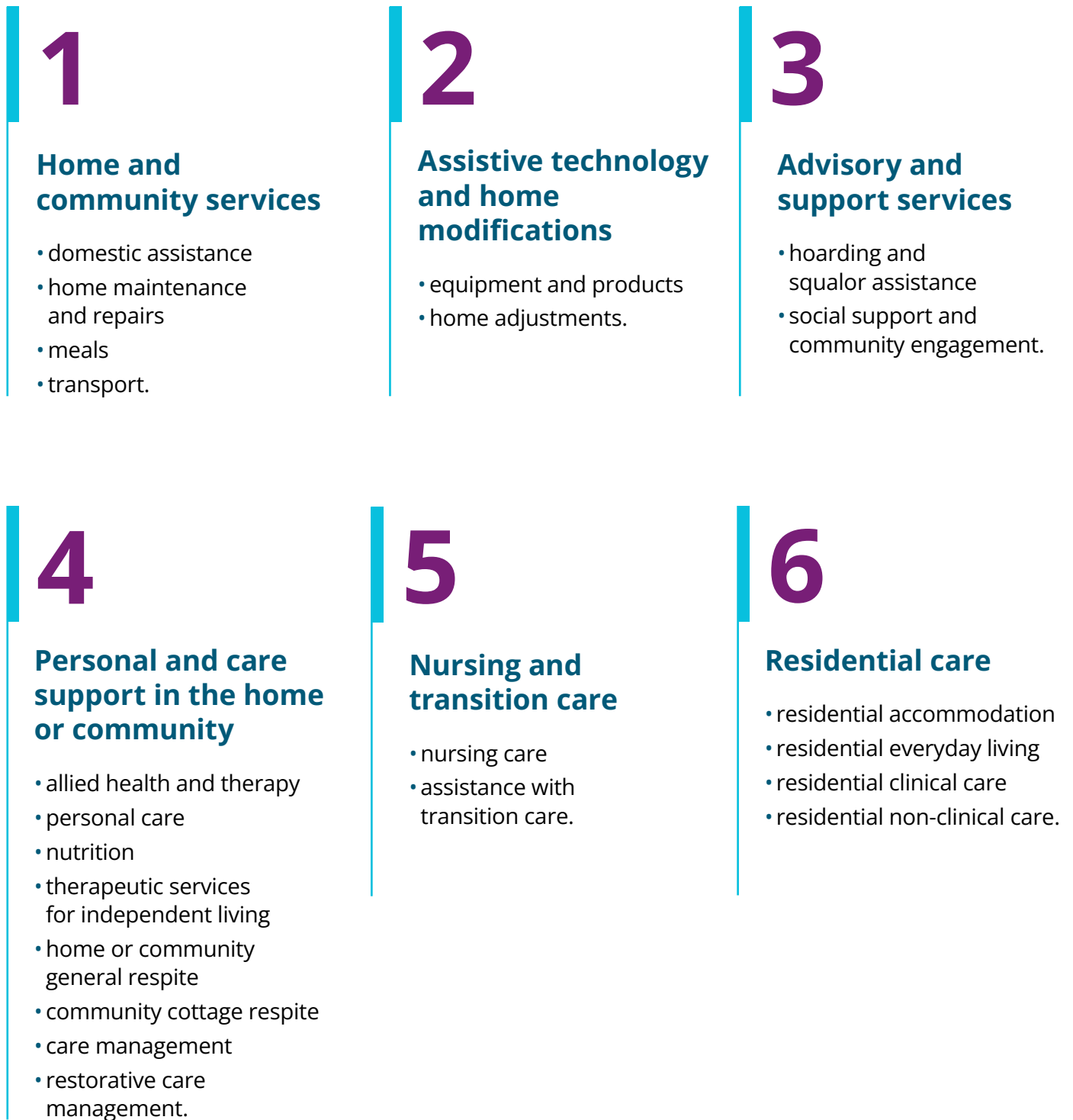
Figure 2. Registration categories and service types